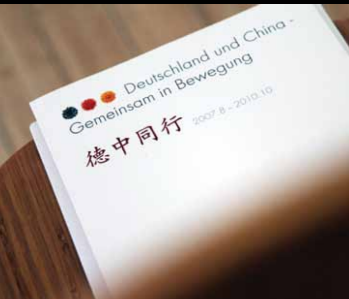
Form bonded furniture and construction of the storefront made by OLDENBURGER for the German - Chinese House (DuC) at the Expo 2010 in Shanghai

无论是弯曲竹木家具还是外部的构造，2010年上海世博会上的德中屋，全部由欧德保搭建打造