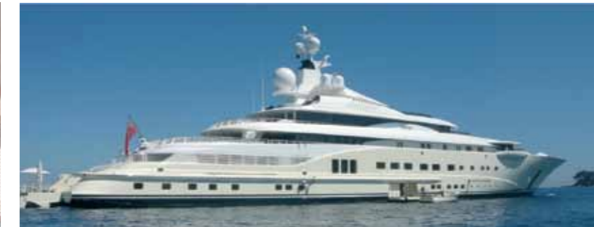
Exclusivity from a single source: Made-to-measure luxury interiors 独特尊贵的唯一的源泉： 豪华内饰的量身定制