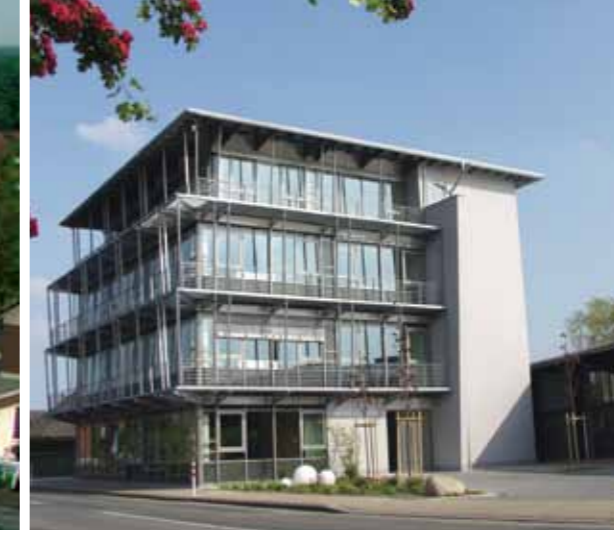
An inspiring workplace: The new offices set clear architectural standards. 一个灵感工厂： 新办公室确立了简洁的建筑标准