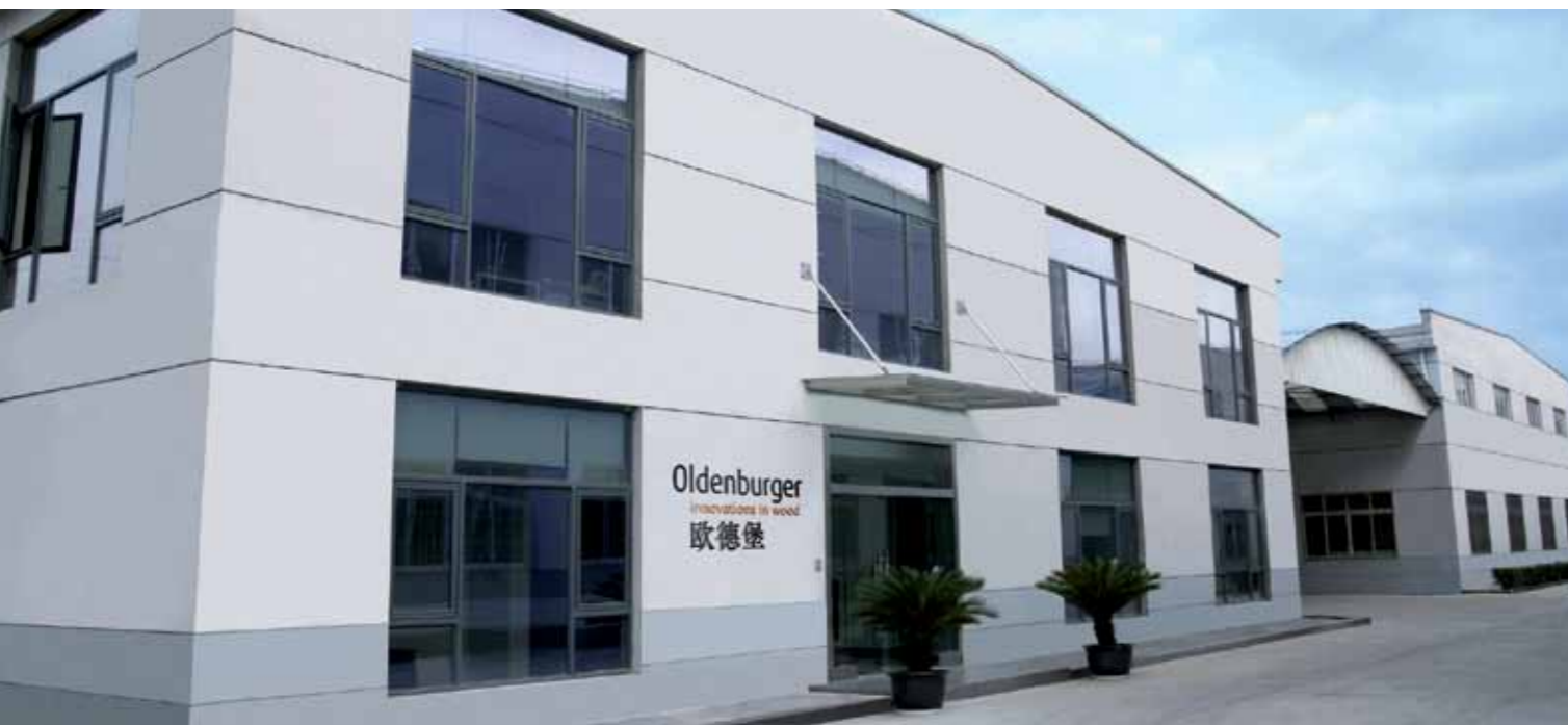
Company building of Oldenburger in Anting (Shanghai) 上海安亭欧德堡厂房