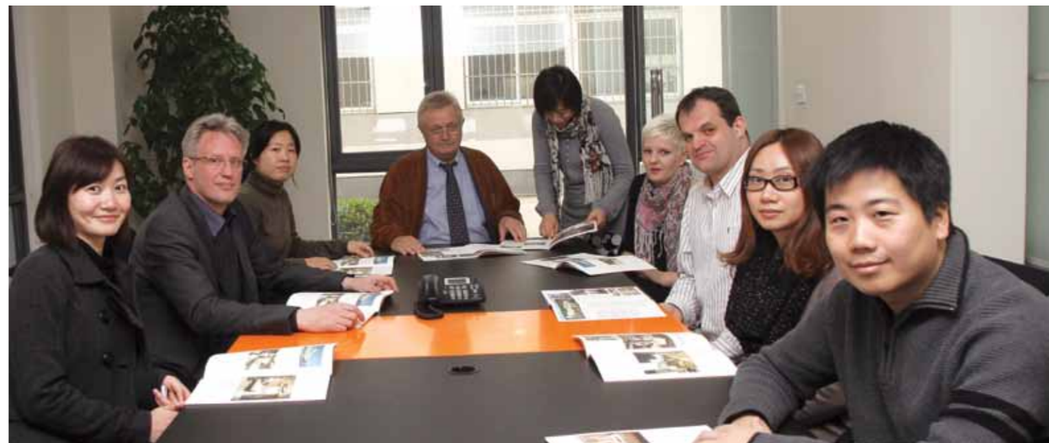
Management Team 管理团队