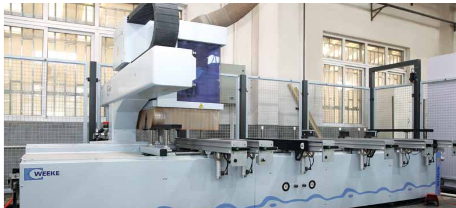
CNC(Computer Numerical Control)Processing Center CNC数控中心